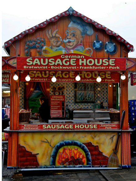
Bury St. Edmunds Christmas market