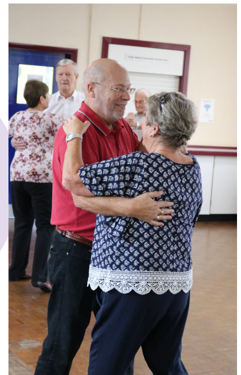
Strutting their stuff at 'Lou's Moves'.