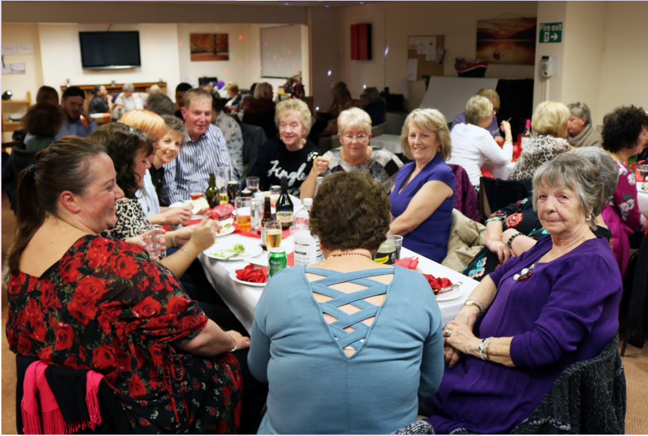
Nifties enjoying their 'lunch club'.