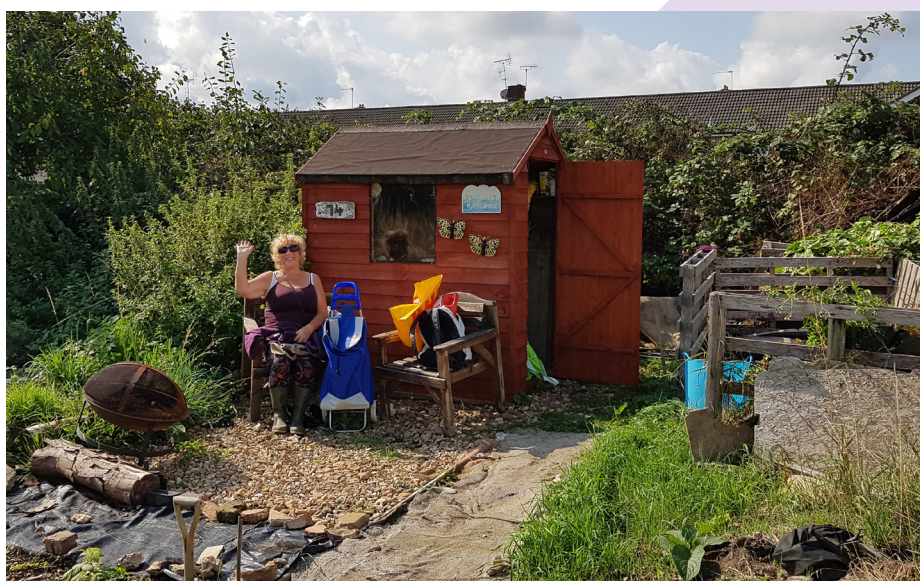
Nifties' Community Allotment.