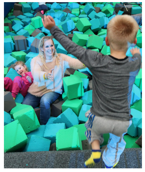
Parents and children enjoying Jump In!

The morning was a real hit! The feedback showed that parents really appreciated the existence of the group.