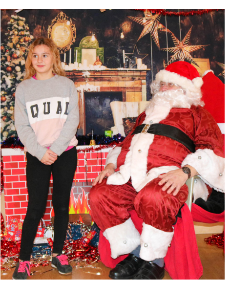
Father Christmas was a big hit!

The whole event, including travel and snacks, was totally free – allowing parents to have fun, stress-free quality time with their children without worrying about affordability. This was one of the key issues the group wanted to address.